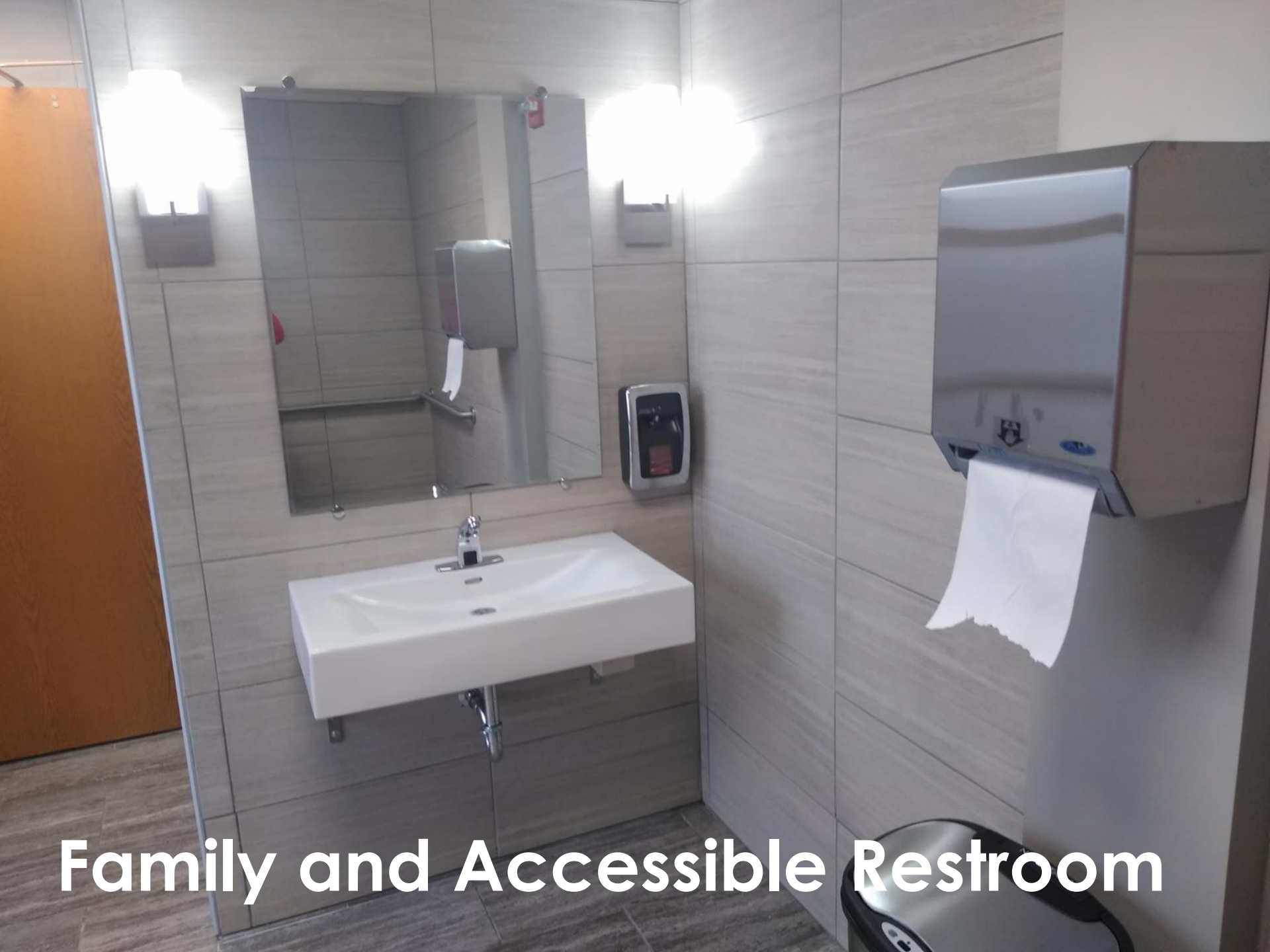
Family and Accessible Restroom